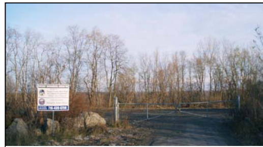
Demolition Completed – 2011