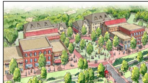
Reuse Conceptual Plan