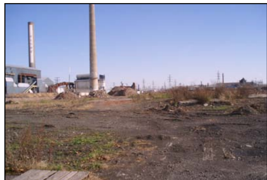
Remediation Complete - 2011