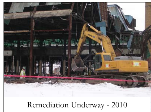
Remediation Underway - 2010