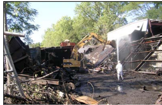
Remediation – 2011