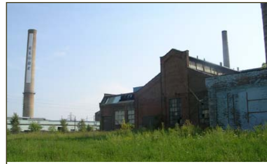
Site Building – 2008

Santarosa Holdings Inc. continues to work with end users for the site. 14.1 acres of the 18 acre site are under contract to Falls Metal Recycling for development into a metal recycling and reclamation green facility. The proposed $13-$15 million development will create 45 new jobs. One additional company has an option to purchase the remaining 4 acres of the site. Proposed development for this portion of the site is for green energy production and a potential $18 million investment with 50 new jobs.