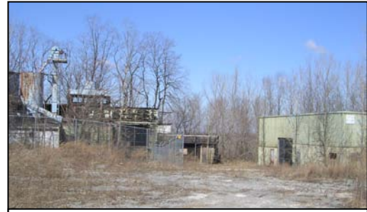
Site Buildings – 2006

In addition to traditional site marketing, redevelopment planning at this strategic site has taken place. A conceptual reuse plan was developed for the City and includes mixed-use redevelopment including some residential and small scale commercial. Public open space is incorporated into the design.